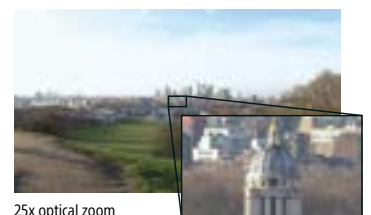
25x optical zoom